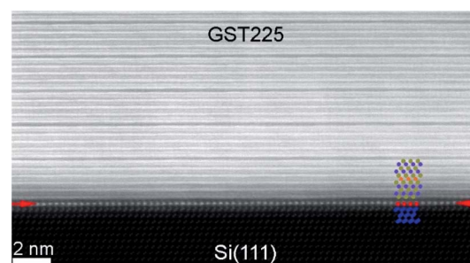
Fig. 8 Atomic-resolution HAADF-HRSTEM image of the interface between the Si(111) substrate and trigonal GST225 thin film. The Sb/Te passivation layer on top of the substrate is marked by red arrows. The insert shows a scheme of the Si–Sb/Te–GST225 interface. The Si atoms are marked by blue spheres and the Sb/Te passivation layer is shown by red spheres whereas Te atoms are marked by olive spheres and azure/orange spheres represent Sb/Ge atoms. Due to the slight in-plane rotation of the GST225 crystal structure, the Te, Sb and Ge atomic columns are not resolved in the HAADF image.

Recent advances in the epitaxial growth of GST based thin films on Si(111) by MBE and PLD have provided deeper insights into the microstructure evolution in metastable cubic GST