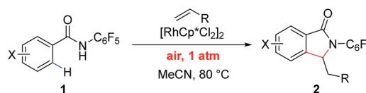
Scheme 1 Aerobic Rh(III)-catalyzed C–H olefination.