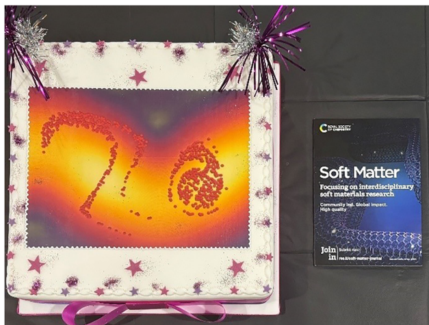
Fig. 2 Soft Matter 20th Anniversary cake (image from https://doi.org/10.1039/D5SM90056E ).