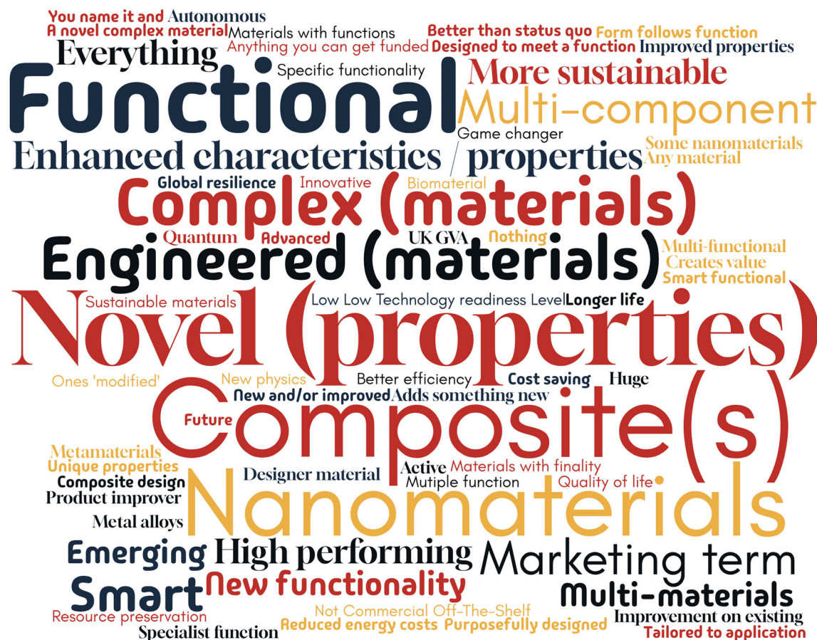
Fig. 1 Word cloud response to the question – What do you define as an Advanced Material? (111 responses). Note that limited preprocessing of responses was undertaken prior to generating word clouds to group similar terms and harmonise.

trust and acceptance by society, but the two most popular were understanding legislation and finance (Fig. S3†).