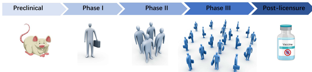
Fig. 6 The evolving stages of vaccine development.