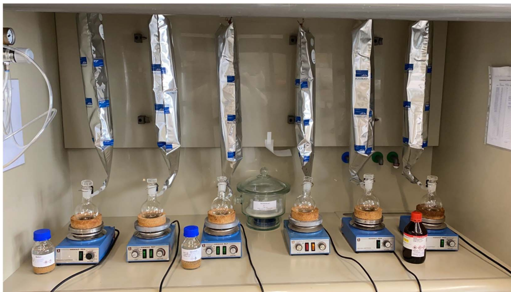
Fig. 1 Silylation work station under argon protection using filled gas bags.