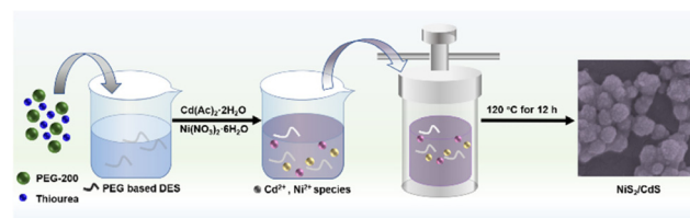
Fig. 1 A schematic illustration of the formation of NiS_2/CdS photocatalyst.

For the characterization of the obtained samples, the following techniques were used. X-ray powder diffraction (XRD) performed on a D/max-2550/PC diffractometer (Rigaku), a scanning electron microscope (SEM), energy dispersive X-ray spectroscopy (EDS), and elemental mapping images on a Hitachi