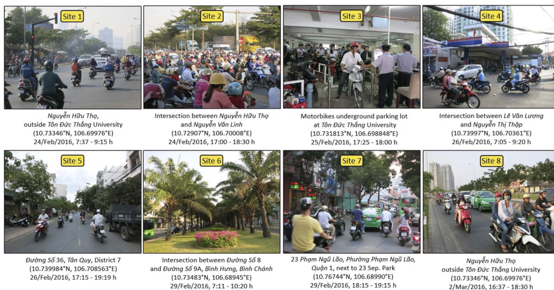
Fig. 1 Measurement sites. Except for site #3 that was only affected by motorbike emissions, all sites were also affected by emissions from passenger cars to a lesser extent. Large diesel trucks were only observed at site #2, and public buses at sites #4 and #7. Contributions from street food stalls and trash burning were experienced at all sites, to a greater extent at sites #1 and #8. The ESI includes a map (Fig. ESI1†) indicating the location of the measurement sites within HCMC urban sprawl.

(CO) mixing ratios were also measured as a tracer of traffic emissions during the street level measurements. We used relationships between pPAHs concentration and ASA as fingerprints of particles originated from combustion sources. 35,36 In addition to traffic particles, we saw that pedestrians and commuters were also exposed to cooking and biomass burning particles from street food stalls and trash burning, which were inherently included in the measurements. Similarly, assuming spherical particles, the concurrent and independent measurements of PN concentration and ASA were used to estimate the size of the particles by the diameter of average surface ( D_{Aver,S} ) as proposed by Kittelson et al. 37