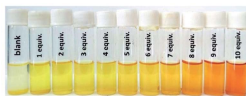
Fig. 15 Colorimetric detection behaviour of the HEPES suspension of \text{UiO-66}-(\text{NO}_2)_2 with increasing concentration of \text{Na}_2\text{S} in daylight.

\text{Eu}^{3+}/\text{Ag}^+@ \text{UiO-66}-(\text{COOH})_2 (EAUC) composites were reported by Li and Qian as biomarkers for the potential diagnosis of asthma. 96 The decrease of the \text{H}_2\text{S} production in the lung has been identified as an early detection biomarker for asthma. Thus, fluorescent experiments showed that EAUC exhibited high selectivity and sensitivity with a limit of a real-time \text{H}_2\text{S} detection of 23.53 \mu\text{M} . The detection of \text{H}_2\text{S} by EAUC was based on the introduction of active metal centre ( \text{Ag}^+ , \text{H}_2\text{S} -responding site) to the \text{Eu}^{3+}@ \text{UiO-66}-(\text{COOH})_2 as the lanthanide-luminescence sensitizer. 96 MTT assay and cell viability analysis in PC12 cells demonstrated relatively low cytotoxicity for EAUC and biocompatibility. Finally, the determination of \text{H}_2\text{S} was tested in diluted fetal bovine and human serum samples demonstrating that EAUC can detect \text{H}_2\text{S} in real biological samples. Zhang and co-workers 97 covalently modified ( via click chemistry) PCN-58 with target-responsive two-photon (TP) organic moieties to fluorescently detect \text{H}_2\text{S} . These TP-MOF probes showed good photostability, high selectivity, minor cytotoxicity, and excellent \text{H}_2\text{S} sensing performance in live cells. These modified PCN-58 materials also showed intracellular sensing and depth imaging capabilities (penetration depths up to 130 \mu\text{m} ). 97