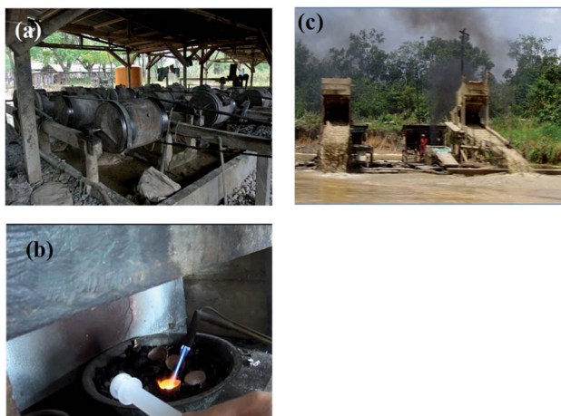
Fig. 1 Details of the measurement sites. (a) Ball mill method in Poboya near Palu, (b) Mercury–gold amalgam is heated, evaporating the mercury and leaving gold at a gold shop, (c) dredging operation in the Kahayan River.

a D deterministic value, P probabilistic distribution function. b Alphabet corresponds to Fig. 4 and SI3. c St. No. (station number) is shown in Fig. SI1. d Corresponds to Fig. 3(a) portable handheld mercury analyser method, (b) high-resolution measurement method, (c) gold trap method, and (d) passive sampling method. e “—” we could not obtain a dataset.