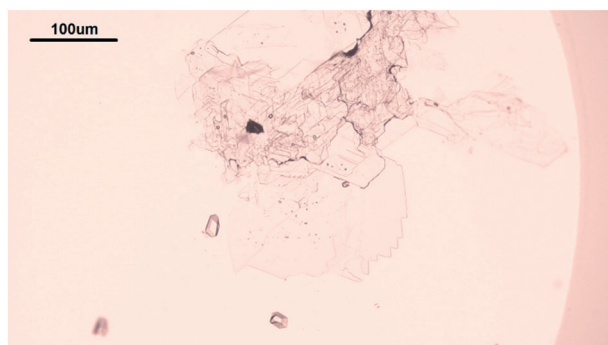
Fig. 6 Insulin crystals (middle towards bottom) in the presence of leucine crystals (top middle part), obtained after 72 days. Leucine forms crystals with sheet like shapes whereas insulin shows rhombohedral shapes.

The impact of amino acid concentration and type on the solubility of human insulin was studied to investigate the mechanism of the soft-templated crystallisation. Fig. 8 shows that the solubility of insulin increases if arginine, leucine or glycine is added with concentration between 0.001 and 0.1 M. While leucine or glycine increase the solubility of insulin of up to 3.2 folds, arginine increases the solubility significantly for concentration above 0.01 M to a maximum of 18.3 folds at arginine concentration of 0.06 M and 0.1 M. These findings agree with reported studies on the increasing effect of amino acids on peptide and protein solubility. 48 The solubility also reveals that the effect of arginine and leucine is not due to a change in the thermodynamic equilibrium (solubility) but rather of kinetic nature. Hence, we hypothesize that both, arginine and leucine, promote favourable protein-protein interactions between insulin molecules which increases the likelihood of nucleation.