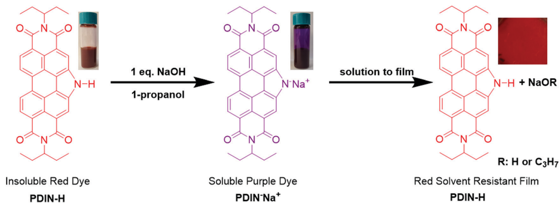
Fig. 1 Chemical structure of PDIN-H. Treatment of a 10 mg mL -1 slurry of PDIN-H in 1-propanol with 1 molar equivalent of NaOH produces a purple ionic solution. Spin-coating this solution onto a PET substrate yields a red colored organic film owing to the spontaneous protonation of the PDIN - anion. This process mimics that of classic acid dyeing of textiles.