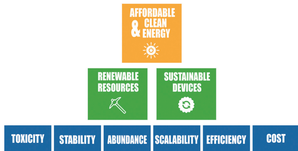
Fig. 1 In order to achieve the Sustainable Development Goal (SDG) number 7, affordable and clean energy, that world leaders have agreed upon in 2015, this energy needs to come from sustainable devices produced by renewable resources and other selection parameters.

Out of the several renewable energy sources, such as wind, tidal or biomass energy, solar energy is one of the most promising resources due to its abundance and omnipresence. It is estimated that the world's total energy use equals only approximately 0.00015% of the solar energy reaching the earth. 3 Furthermore, solar energy can be converted into both electricity and fuels, which makes its storage and transport over long distances easier. In order to fully transit into a carbon free future, the development of solar harvesting is inevitable and needs to reach large-scale deployment, taking the scalability, safety, efficiency and durability into consideration, as illustrated in Fig. 1. Most of the research today focuses mostly on improving the efficiency of devices without taking other selection parameters into consideration. However, the energy demand during production, durability and cost of maintenance of the system can mitigate or compensate extra costs and are therefore important factors to keep in mind during the development of new solar cell and solar fuel devices.