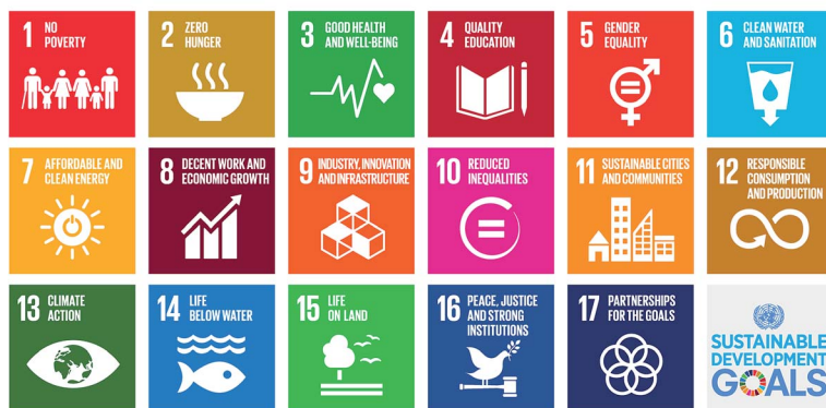
Fig. 1 The 17 SDGs of the UN, aimed at ending poverty, protecting the planet, and ensuring prosperity for all as part of the sustainable development agenda. Each goal has specific targets to be achieved over the period 2015–2030 ( http://www.un.org/sustainabledevelopment/sustainable-development-goals/ ). An 18 th SDG aimed at clean air should be added.