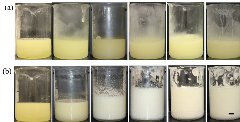
Fig. 5 Photographs of vessels containing mixtures of MA in HOSO at different concentrations (a) before aeration and (b) immediately (within 1 min) after whipping at 22 °C. MA concentrations in wt% are (left to right) 2.0, 3.5, 4.5, 5.0, 6.0 and 10.0. The sample at 2.0 wt% is one-phase, all other samples are two-phase. Scale bar = 1 cm.

Fig. 6 is a plot of the volume of the aerated phase as a function of MA concentration. In cases at lower concentration where not all the oil becomes incorporated into the aerated phase, we account for this in this parameter. In all other cases, the aerated phase contains all the oil and the incorporated volume of air. Once crystals are formed in the oil, foam can be stabilised and, as seen in Fig. 4, increasing the MA concentration at fixed temperature leads to an increase in the concentration of crystals (with little change in their size distribution) and a progressive increase in the foamability. The volume fraction of air in the oil foam increases from 0.22 \pm 0.04 at 4 wt% MA to 0.52 \pm 0.04 at 5 wt% MA and above, a value close to that reported in ref. 22 and close to the random close packing fraction of monodisperse spheres of 0.64. A photograph of a sample of foam prepared from 8 wt% MA is given in the inset to Fig. 6. It is thus likely that foams are stabilised by adsorption of MA crystals to the air–oil surfaces of bubbles and by the network of excess crystals in the oil phase creating a gel and impeding buoyancy-driven creaming of air bubbles within the foams. Whipping MA–HOSO mixtures in both the one-phase and two-phase regions has