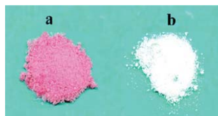
Fig. 2 Picture of poly(methyl methacrylate) (PMMA) synthesised by the RAFT process (a) before and (b) after reaction with AIBN. 45

as the initiating species, resulting in complete removal of the RAFT end group along with the recovery of the RAFT agent. The process was reported to be effective for a variety of polymers and end groups. The structure of the product was confirmed by 1 H NMR spectroscopy and also upon inspection of the polymer colour change (Fig. 2). 45 A subsequent report has demonstrated that while this method is effective for methacrylate polymers, it provides incomplete end group removal when applied to acrylate and styrenic polymers and instead a combination of AIBN and lauroyl peroxide was found to be more effective. 46