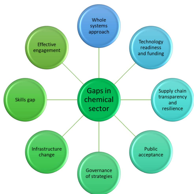
Fig. 6 Common gaps emerging in the chemical industry towards a circular economy of chemicals.

The NASA technology readiness level (TRL) system is widely adopted and adapted across different sectors to assess technology maturity before deployment. 65 Fig. 7 is a schematic example of TRLs for the chemical sector with conversion technologies for ethylene production. Fundamental technologies lie