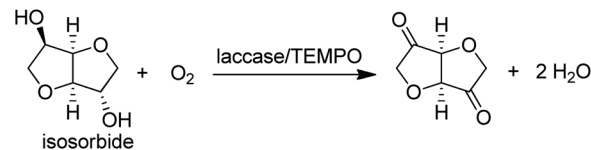
Scheme 12 Laccase/TEMPO catalysed oxidations of alcohols.