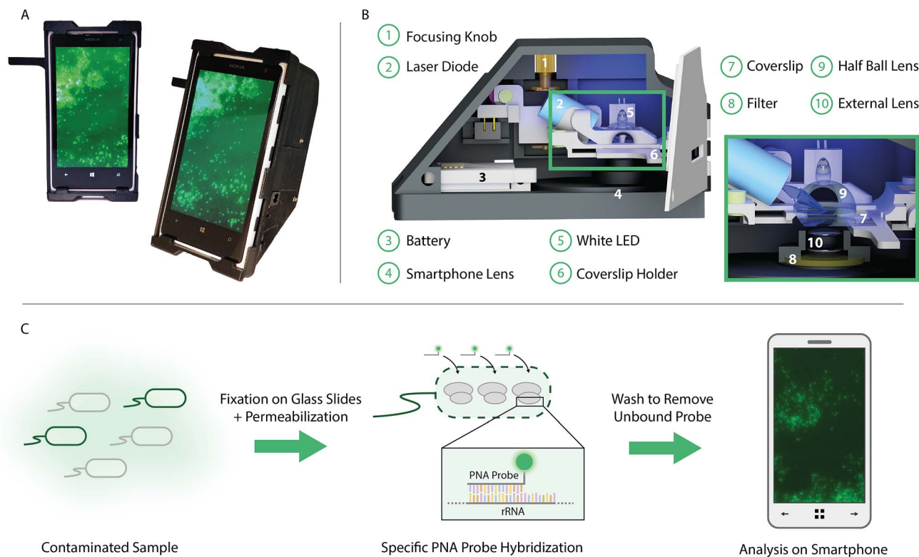
Fig. 1 Selective targeting and imaging of single bacteria on a smartphone. (A) Photographs of a smartphone microscope displaying images of fluorescently labeled Cronobacter spp. bacteria. (B) 3D illustration of the same optomechanical unit that is mounted on the smartphone in (A). (C) Schematic illustration of the bacterial detection procedure. Bacteria from the contaminated sample are fixed on 22 \times 50 \text{ mm}^2 glass slides and the bacterial membrane is permeabilized in order for the PNA probe to enter the bacteria. An Alexa Fluor 488 dye is chemically linked to the PNA probe which in turn is designed to bind specifically to certain regions of the ribosomal RNA (rRNA) of the bacteria. After washing away unbound probes, only the targeted bacteria remain fluorescent and can be imaged using the smartphone-based microscope shown in (A).

\mu\text{m} , yellow-green fluorescent (505/515), ThermoFisher) in ultra-pure water, with concentrations ranging from 10^2 to 10^8 beads per mL. Twenty \mu\text{L} were placed on a coverslip ( 22 \text{ mm} \times 50 \text{ mm} , Premium Cover Glass 12-548-5E, Fisher Scientific) and the solution was allowed to evaporate at room temperature prior to imaging, leaving only the fluorescent beads on the glass coverslips.