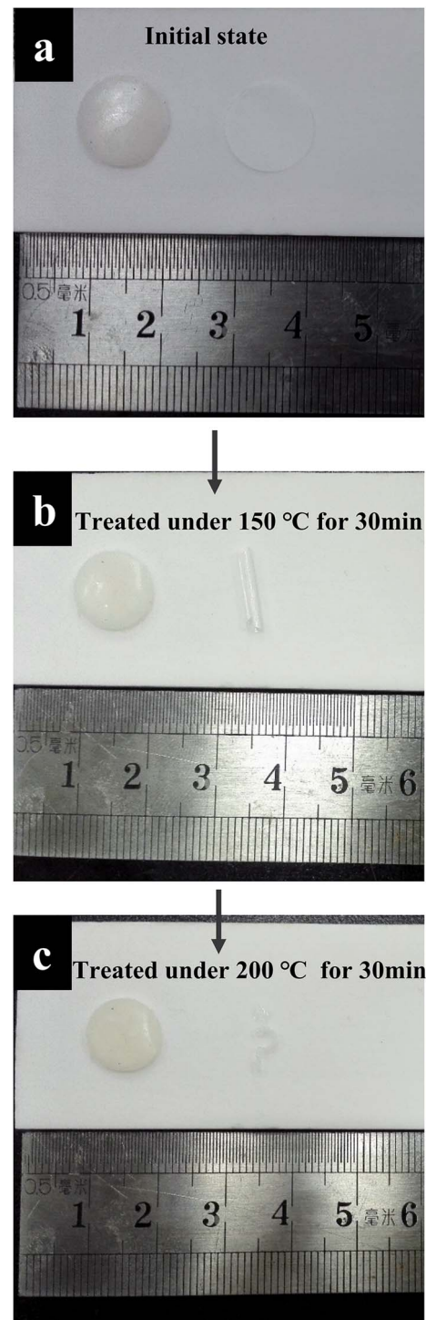
Fig. 2 Photo image of GPE and commercial separator (a) initial state, (b) heat treatment at 150 °C for 30 min and (c) further heat treatment at 200 °C for 30 min.

The weight content of the liquid electrolyte of the prepared GPE is 71.4%. For comparison, gel polymer electrolyte of different liquid content is synthesized (see ESI†) and the influence on ionic conductivity is shown in Table 1. From the