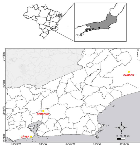
Fig. 1 PM 2.5 sampling sites: GÁVEA: Gávea, PARNASO: Serra dos Órgãos National Park, and CAMPOS: Campos dos Goytacazes. QGIS 3.26.3.

PM 2.5 samples were gathered employing quartz microfiber filters (QFF) of 203 × 254 mm (Whatman, Fisher Scientific,