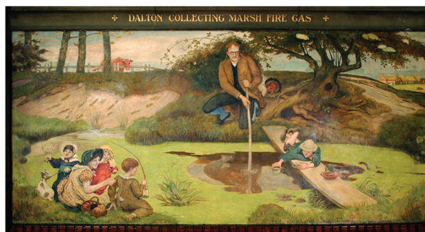
Fig. 2 "Dalton Collecting Marsh Fire Gas" is an 1887 mural by 1887 Ford Madox Brown in the Manchester Town Hall ( https://en.wikipedia.org/wiki/File:BrownManchesterMuralDalton.jpg ).

Atomism was a theme running through science from the late 16 th Century onwards. In his 1612 book, De Principiis atque Originibus , Francis Bacon (1561–1626) presents the case for atomism, although in subsequent work he preferred corpuscularianism. Similarly, Daniel Sennert (1572–1637) in his Hypomnemata Physica develops a model in which matter is composed of indivisible atoms although he also subscribed to the Aristotelian four elements—earth, air, fire, and water. Robert Boyle was a convinced atomist, but he also made important contributions to understanding what should be described as an element. He differed from Sennert in rejecting