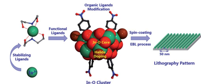
Scheme 1 Illustration of the assembly of the atomically precise \text{In}_{12} -oxo clusters with chemical modification and patterning evaluation.