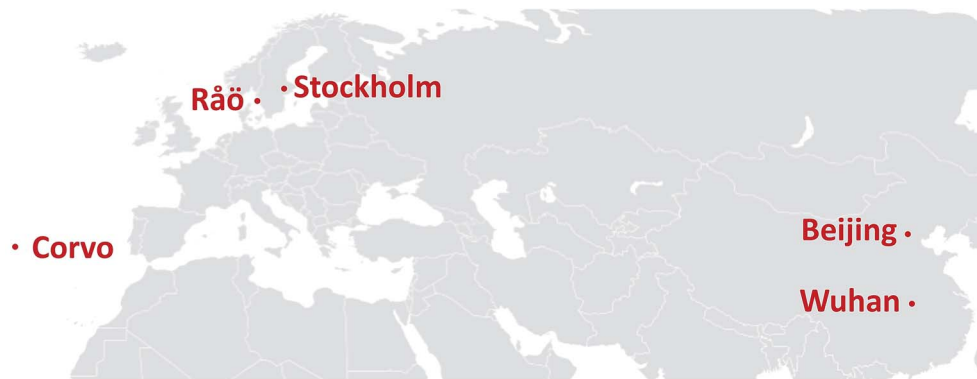
Fig. 1 Map showing the sample sites.

Shanghai (about 690 km from Wuhan). We are not aware of any fluoropolymer plant located closer to the sampling sites. While Wuhan is a site which may be influenced by industrial point sources, Beijing was chosen to represent an urban background environment in a source region. Two sites receiving input from sea spray were included in the study: Råö and Corvo. Corvo is the smallest and the northernmost island of the Azores archipelago, located in the North Atlantic Ocean, 3700 km east of Portugal. The island has approximately 450 inhabitants. Råö is a rural island on the Swedish west coast. Råö is used as a background station in the Swedish environmental monitoring program, but is not considered a remote site as it receives air masses from the European continent. Samples were also taken in Stockholm, a site selected to represent an urban European site. Metropolitan Stockholm has 2 270 000 inhabitants and is located on the Baltic Sea coast. Large-scale manufacturing of PFAAs has not occurred in Scandinavia. Therefore, none of the European sites are expected to be influenced by direct industrial emissions.