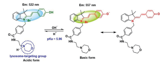
Fig. 2 pH switching of CPY for the ratiometric monitoring of lysosomal pH changes

Then, the stability of the fluorescence performance of CPY was evaluated towards different aqueous solutions with pH values of 4.5, 7.4, and 10.5, respectively (Fig. S1b, ESI<sup>†</sup>). No change of the fluorescence ratio F_{522}/F_{557} was observed, even when the time increased to 110 min, indicating a stable pH sensing process with CPY. To explore if other biological reagents could interfere with the pH sensing of CPY, some commonly available biological species were evaluated as interferences (Fig. S1, ESI†). The ions and bioactive molecules had imperceptible influence on the fluorescence of CPY in both weak acid (pH = 4.5) and neutral (pH = 7.2) environments (Fig. S1c and d, ESI†). Finally, the influence of different temperatures (from 37 °C to 45 °C) on the fluorescence of CPY was also investigated. The fluorescence ratio F_{522}/F_{557} of CPY solutions at pH values of 4.0, 6.0 and 9.0, respectively, remained stable when the temperature increased from 37 °C to 45 °C. All these results demonstrated the stable fluorescence performance of CPY in ratiometric sensing of pH changes (Fig. S6, ESI†).