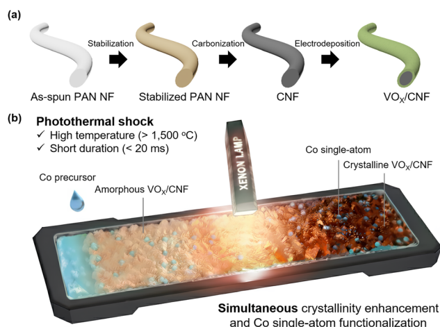
Fig. 1 (a) Schematic illustration of fabrication of amorphous VO x on CNF. (b) Schematic illustration of the synthesis of Co/VO x /CNF via ultrafast photothermal shock process, highlighting the simultaneous crystallinity enhancement and Co single-atom anchoring.