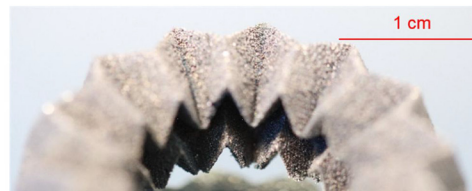
Fig. 1 Printed PM of novel shape with cooling channel.