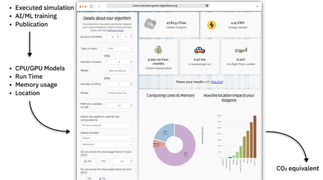
Fig. 3 Tool such as green algorithm calculator (https://calculator. green-algorithms.org ^{138} ) can be used to retroactively calculate the CO<sub>2</sub> equivalent form already run computations or publications providing the number of CPU/GPU hours and model.

tion and don't factor in other aspects like a more complete life cycle assessment also of hardware production.