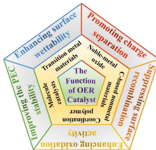
Fig. 2 The schematic illustration of the function of OER catalysts in PEC water splitting.

Up to now, noble-metal (Ru and Ir etc. ) oxides, transition metal (Fe, Co, Ni etc. ) oxides/hydroxides/hydroxyl oxides, C-based nonmetal materials, coordination polymers, and molecule catalysts have been widely used as OER catalysts for improving the interface charge transfer and surface water oxidation dynamics in the PEC water splitting process. Specifically, transition metal-based materials were more popular in “OER catalyst/semiconductor” photoanode construction due to the significant advantage in material costs, preparation methods and activity requirements. Recently, molecular catalysts, complexes based on Ru, Ir, Fe, Co, Ni and Cu, have been reported as novel OER catalysts owing to their high activity and tunability, as well as their ability to be integrated into sophisticated molecular assemblies, 48,49 which were generally