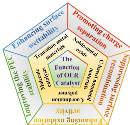
Fig. 2 The schematic illustration of the function of OER catalysts in PEC water splitting.

Up to now, noble-metal (Ru and Ir etc. ) oxides, transition metal (Fe, Co, Ni etc. ) oxides/hydroxides/hydroxyl oxides, C-based nonmetal materials, coordination polymers, and molecule catalysts have been widely used as OER catalysts for improving the interface charge transfer and surface water oxidation dynamics in the PEC water splitting process. Specifically, transition metal-based materials were more popular in “OER catalyst/semiconductor” photoanode construction due to the significant advantage in material costs, preparation methods and activity requirements. Recently, molecular catalysts, complexes based on Ru, Ir, Fe, Co, Ni and Cu, have been reported as novel OER catalysts owing to their high activity and tunability, as well as their ability to be integrated into sophisticated molecular assemblies, 48,49 which were generally