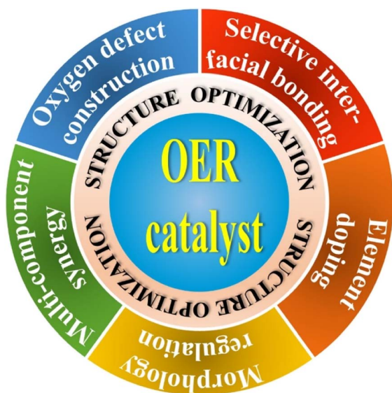
Fig. 3 The summary of design strategies for further enhancing the OER catalyst activity.

Recently, other strategies such as heteroatom incorporation, in situ activation and precursor regulation have also been demonstrated to construct oxygen defects in OER catalysts for further promoting the PEC water splitting activity. For instance, Wang et al. reported a two-step photo-assisted electrodeposition