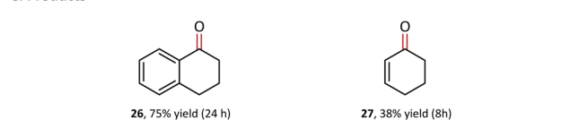
Fig. 4 Photoanode-mediated C–H oxygenation at the \alpha -position of the alkane and arene.

(alcohols, aldehydes, and ketones) from cheap alkanes. 74,75 To date, a few PECs adopting this strategy have been successfully established. 76–79