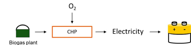
Fig. 1 Schematic representation of combined heat and power (CHP) production: independently from renewable energy availability, biogas is combusted to produce electricity.

The capital cost is accounted for as follows: