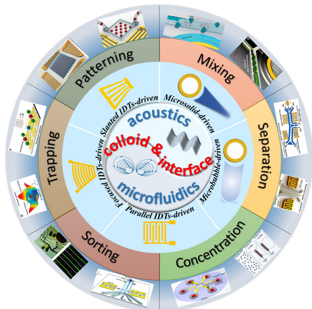
Fig. 1 Acoustic microfluidics for colloidal materials and interface engineering enabled by the functions of mixing, separation, concentration, sorting, trapping, and patterning. Reproduced with permissions from ref. 24, 32, 38, 48 and 50–57, respectively.

and aluminum nitride). BAW microfluidics that usually work under a frequency of several hertz to a few hundred kilohertz can be further divided into microsolid-driven microfluidics and microbubble-driven microfluidics (Fig. 2a). Microsolid-driven microfluidics relies on the oscillation of solid microstructures (mostly triangular objects) inside the microchannels upon acoustic actuation, which can induce a pair of counter-rotating vortices