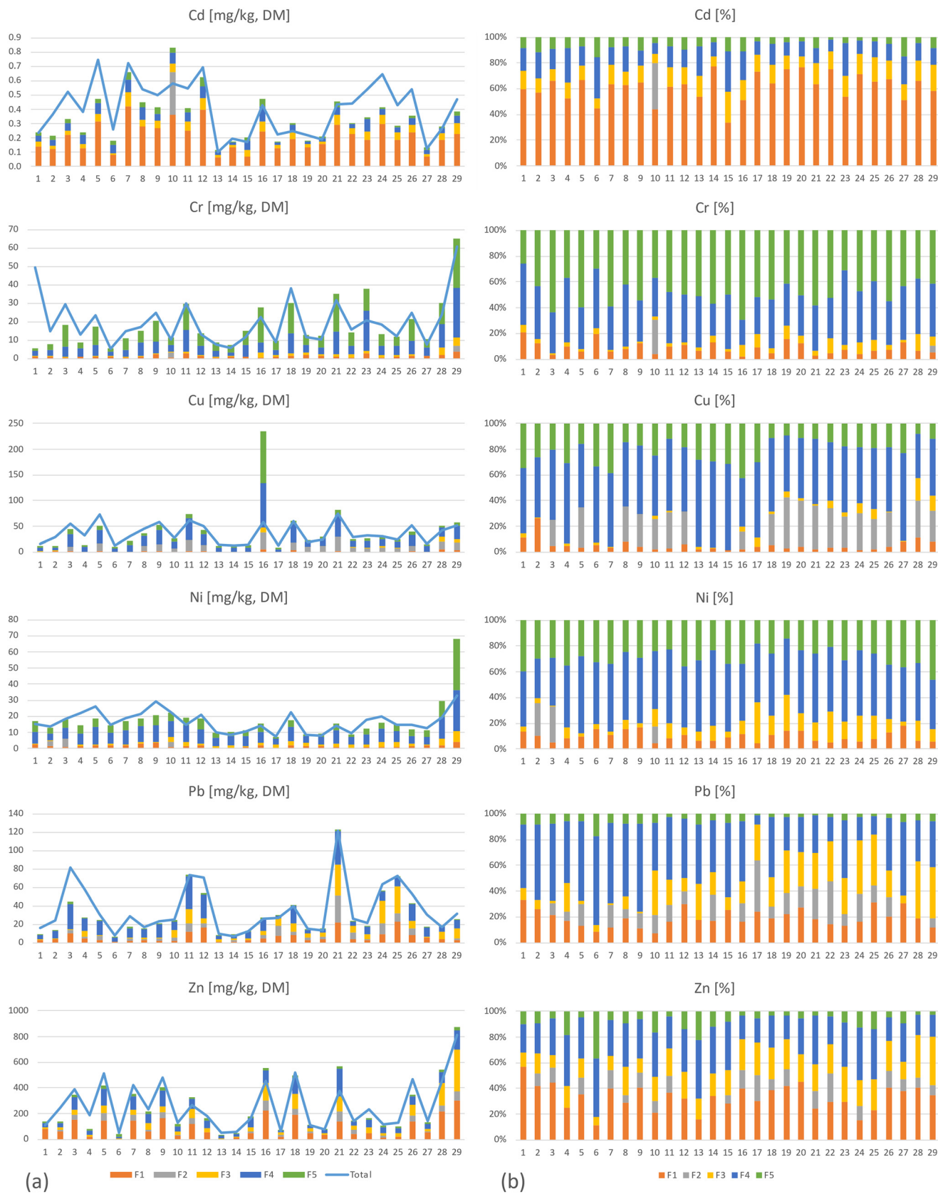
Fig. 4 Fractionation of Cd, Cr, Cu, Ni, Pb, and Zn for all sites (1–29). (a) The graphs to the left are reported as total concentrations ( \text{mg kg}^{-1} , DW), while those (b) to the right report the distribution between fractions (%).