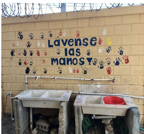
Fig. 6 Handwashing station at Escuela Primaria La Torre with handprints from the school's students.

While the engineering portion of the project was relatively easy to design and implement, it will not be successful without