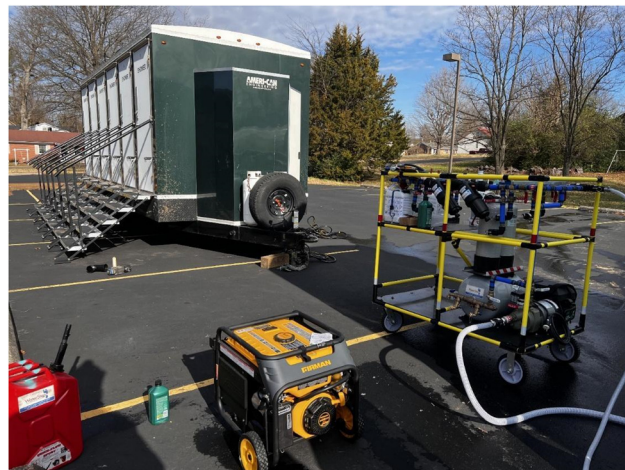
Fig. 34 WOW cart providing water for mobile showers in Western Kentucky.