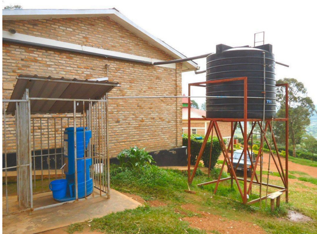
Fig. 25 A Naiade (on the left) and rainwater harvesting tank on a primary school in Kigali, serving 240 children and 20 staff members.

Technically, the Naiade system has proven to work as it has been designed and has been tested by UNESCO IHE: “Under the conditions tested, it was found that Naiade UV disinfection system could remove total coliform and E. coli from the raw water up to 3 to 4 log removal”.