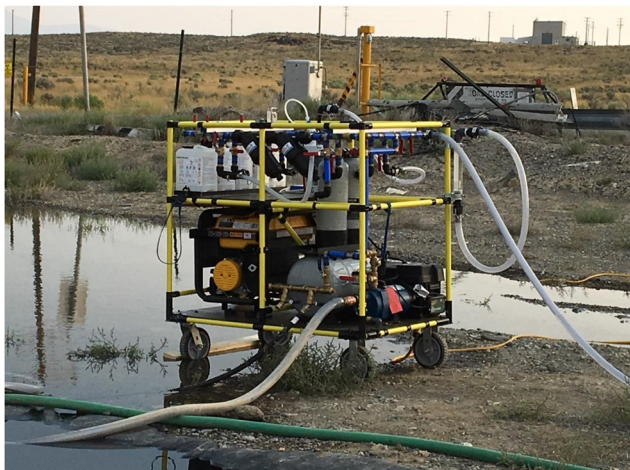
Fig. 33 WOW cart.