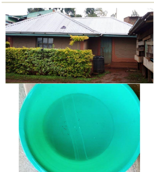
Fig. 16 Worms in water collected from water storage tank.

The collected rainwater is commonly stored in polystyrene tanks, metal jerry cans, clay pots and other water storage containers. Galvanized corrugated iron sheets are the commonly-used housing roofing material for most communities in Kenya, including the rural communities at Nyamesocho village (Fig. 16). Therefore, the rainwater is often collected from such roofs. Notably, if not filtered, the collected and stored rainwater is contaminated by dirt found in the rooftops originating from bird and some animal droppings, tree leaves, etc. In the past, visible worms frequently have been seen in the stored rainwater (Fig. 16), which is a confirmation of the reports on the growth of microbial contaminants within water storage containers. 46,47 Also, if the water is stored for long periods of time, it can produce an unpleasant smell, which can prevent people from drinking it. Therefore, this project was designed to collect,