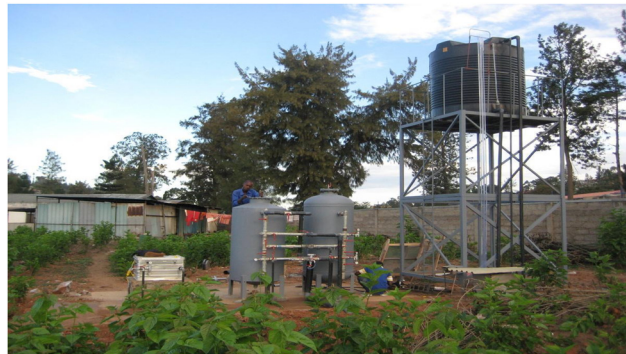
Fig. 27 An example of the Manna Energy Limited water treatment system. The system is installed in-line with existing water pipes. On the right is an elevated backwash tank. In the center is a gravel filter and a pressurized sand filter. On the left is the solar photovoltaic-powered UV system.

The Manna Energy Limited and Portland State University in-line water treatment system was developed as an evolution of the BYOW treatment system in Rwanda between 2007 and 2010. This in-line treatment system was designed to provide a much higher volume of water for communities and schools, up to 100 LPM. The system design was motivated by a partnership with the Rwanda Ministry of Education and designed to be fully funded and maintained through the generation and sale of United Nations carbon credits, offsetting both the actual use and demand for firewood for water boiling. This technology was deployed as the first-ever demonstration of this business model globally.