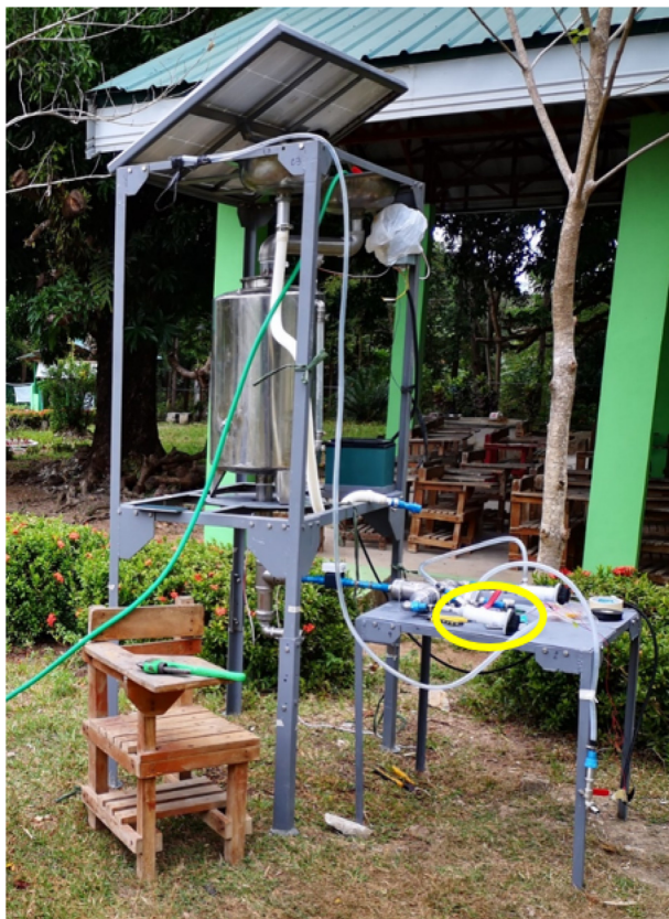
Fig. 22 Pilot setup of solar-powered UV LED water disinfection system in Panobolon Island, Guimaras, Philippines. The UV LED module is enclosed in the yellow circle.

A team from the University of Tokyo worked with the University of San Agustin and the Philippine Science High School Western Visayas Campus to install a solar-powered UV LED system (Yu Jeco, Larroder and Oguma, 2019). Since the island has no access to the commercial power grid, the solar-powered UV LED disinfection system was introduced by the team as a feasible technology (Fig. 22). The team set a long-term goal to let the residents learn how to operate and maintain the system by themselves; therefore, community members were encouraged to join a free workshop to learn the basics of public health and UV disinfection.