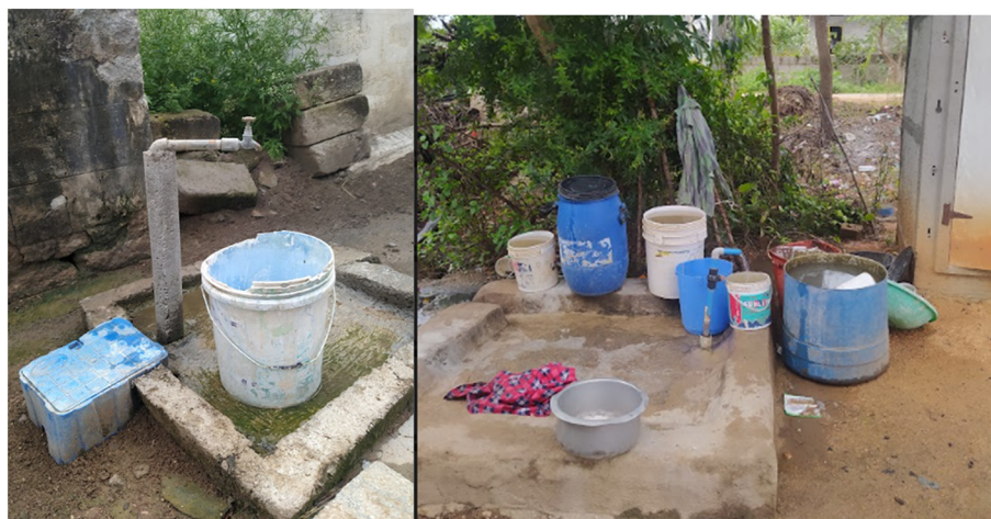
Fig. 7 Community water taps.

To obtain bacterial presence or absence for the water source examined, the samples were kept in a custom-built field incubator under conditions that are suitable in terms of