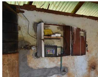
Fig. 18 System components that were designed and constructed by the welder; (left) a solar panel bracket holds the panel in place on the roof and locks so the panel cannot be stolen, and (right) a box to protect the system from tampering.

All of the UV system components were functional in 2020, but they were not being used consistently due to technical constraints. One major barrier was a problem with energy surges that were not properly mitigated by the charge controller in the system. There were issues with both locally and United States-sourced low-cost charge controllers. As a result, lamps would frequently burn out and need to be replaced. A surge protector was installed (which was unavailable locally), but the surges were frequent, requiring that an operator check the system before each use, which was not practical. Further, parts for the VIQUA VT1 system were not available locally and needed to be sourced from a company in Uganda (which needed to order them from Canada). Alternate UV systems were available at the local water equipment supplier, Davis and Shirtliff. Rigorous testing of locally available supplies and design of treatment systems using only these supplies would have prevented many of the technical issues encountered.