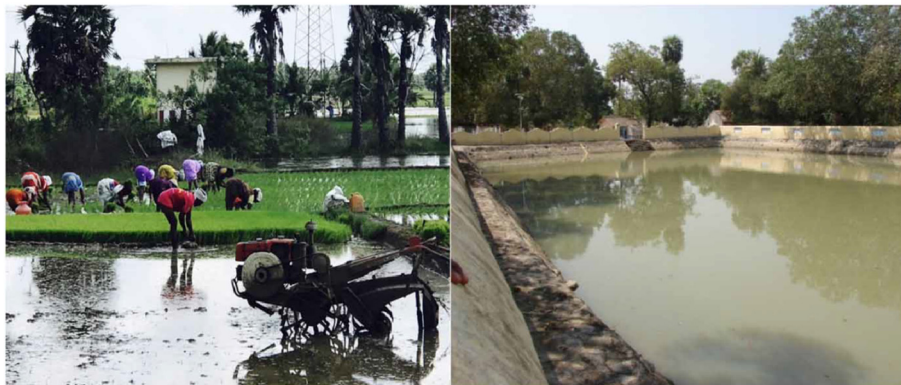
Fig. 10 Pattikadu Oorani.