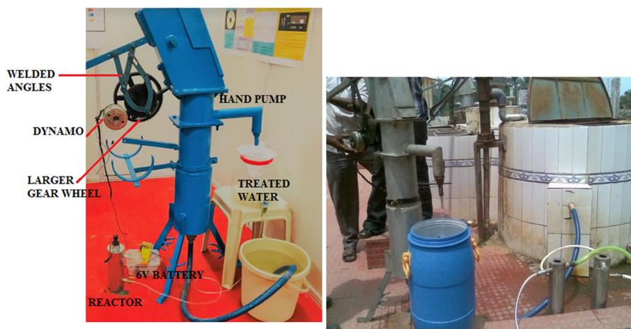
Fig. 11 Fitting of experimental setup on Pattikadu Oorani. The hand pump with gear wheel, shown on the left, was modified to drive a gear system linked to a dynamo, converting mechanical energy into electricity and charging a 6 V DC battery. The UV LED reactor is the silver cylinder in the bottom right of the right photo.

E. coli concentrations were measured using the pour plate method, which involved adding 1 mL of the sample to 20 mL of nutrient agar in sterile Petri dishes and mixing, solidifying, and incubating at 30 °C for three days before colony counting (IS 14648:2011). The initial colony count was 133 \pm 8 CFU mL -1 . E. coli inactivation of 100% was observed in six minutes of disinfection time in the UV LED batch annular reactor fitted with the hand pump.