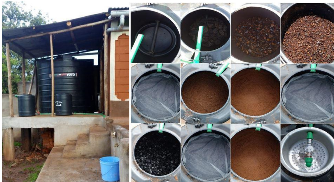
Fig. 17 (Left) Rainwater collection, filtration and disinfection system. (Right) Biosand and biochar layers within the filtration system.

7.4.3. Electrical power. Although most of the local communities in the rural village at Nyamesocho are connected to grid line electricity, the electricity is not continuous, which affects the functioning of the UV LED