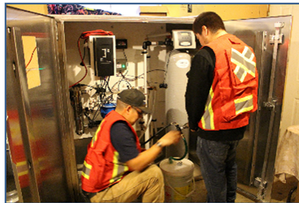
Fig. 3 The Lytton POE systems, with the low-pressure UV system, were installed in a secured enclosure, placed inside residents' homes.

An emergency solenoid shut-off valve was located downstream of the UV lamp and was normally closed when the water was not in use, preventing water from reaching the consumer. It also closed if the UV dose was less than 40 mJ cm -2 and if the system lost power, was unplugged or if the UV lamp failed to turn on. In