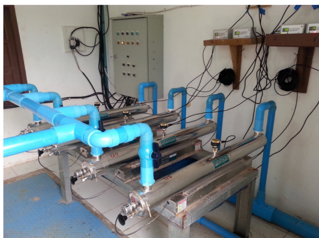
Fig. 15 UV disinfection system.

6.4.3. Fouling and scaling of the UV lamps. Although the lamps incorporated a mechanical wiper assembly for periodic cleaning of the quartz sleeve, the wiper may not