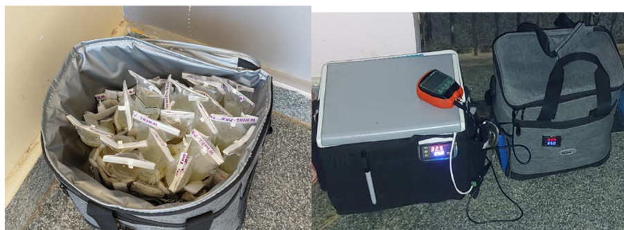
Fig. 8 Field incubator and test kits.

rural areas with intermittent electricity supply. The parts of the incubator were purchased in India and built in the field. Fig. 8 shows the field incubator and the Aquagenx field test