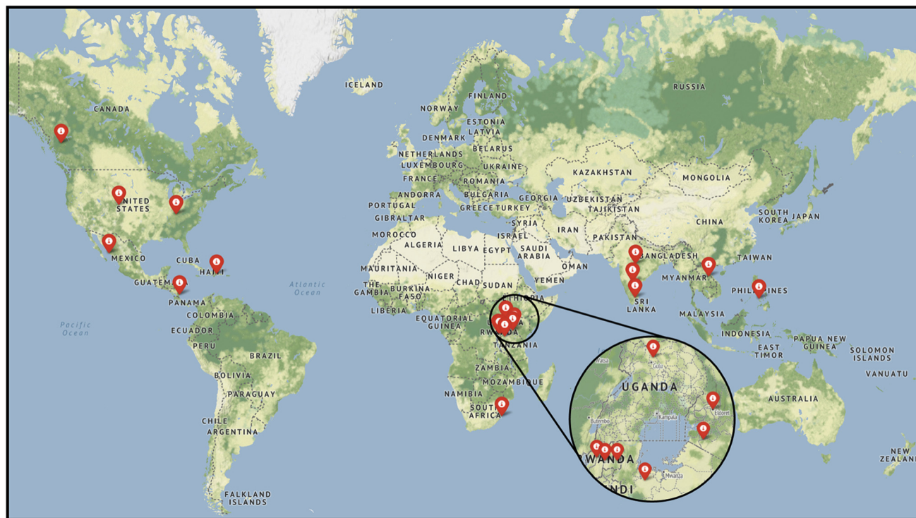
Fig. 1 Map of case study locations highlighted in this paper.

inspire others to report their own experiences with this emerging technology.