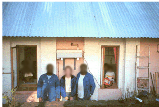
Fig. 29 UV Waterworks 2.0 unit installed on the exterior wall of the kitchen at the Lily of the Valley HIV-Hospice near Durban, South Africa.

The design team created a device to disinfect water using the equivalent of a 60 W light bulb at a cost of two cents per ton of water treated, treating 15 LPM, enough for 500 to 1500 people, depending on how many hours the unit is operated