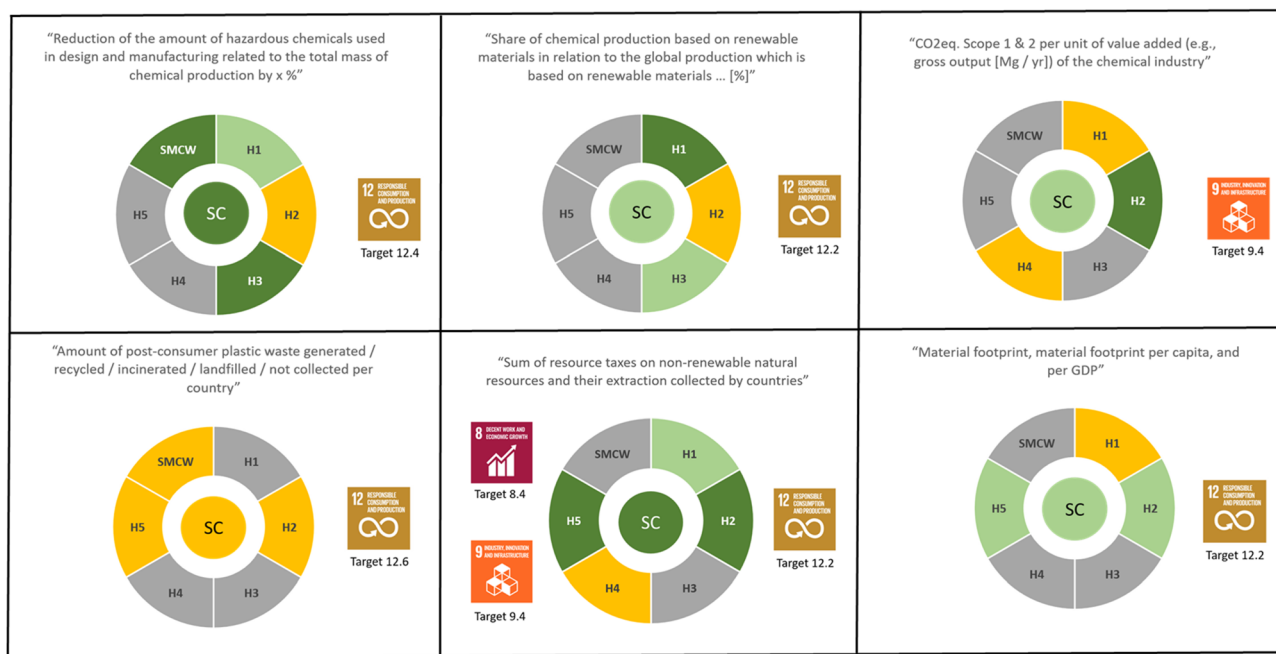
Fig. 2 Relevance of six indicators to Sustainable Chemistry criteria and SMCW as well as their most relevant SDG target(s). Depicted indicators (clockwise): top left: "reduction of the amount of hazardous chemicals used in design and manufacturing related to the total mass of chemical production by x%". Top middle: "share of chemical production based on renewable materials in relation to the global production which is based on renewable materials... [%]". Top right: "CO 2 eq. Scope 1 & 2 per unit of value added (e.g., gross output [Mg per year]) of the chemical industry". Bottom right: "material footprint, material footprint per capita, and per GDP". Bottom middle: "sum of resource taxes on non-renewable natural resources and their extraction collected by countries". Bottom left: "amount of post-consumer plastic waste generated/recycled/incinerated/landfilled/not collected per country". The colours depict the connection (dark green = very strong; light green = strong; yellow = moderate; grey = none) of the indicator to the highlighted sustainability criteria H1–H5 and to SMCW (all outer circle) as well as to Sustainable Chemistry (SC; inner circle) in total. The depiction of SDG targets is based on the highest relevance for the indicator.

• All GFC objectives are covered by at least three indicators (for details see ch. 6).