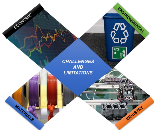
Fig. 9 Challenges and limitations in 3D printing of ecofriendly materials.

The healthcare sector also benefits from sustainable AM innovations. The production of biodegradable medical implants and eco-friendly prosthetics reduces medical waste while enhancing patient-specific treatment solutions. 147 Furthermore, research in biomaterials has led to the development of biodegradable components that naturally degrade over time, eliminating the need for surgical removal and minimizing environmental harm. Similarly, the consumer goods and electronics industries have adopted biodegradable packaging and