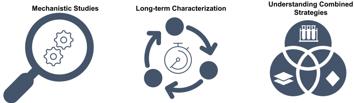
Fig. 4 Summary of avenues for further investigation in the interfacial engineering of lithium metal anodes.

these changes propagate through the lithium films as they become thicker (Fig. 3d). This question has implications for the mechanism of lithium deposition. By using scanning electron microscopy to visualize the diameter and thickness of lithium as it grows away from the current collector, we could understand how lithium growth structures at the monolayer level affect deposition beyond the monolayer level. This could provide insights into structural templates that are beneficial for depositing lithium particles with improved reversibility during battery cycling.