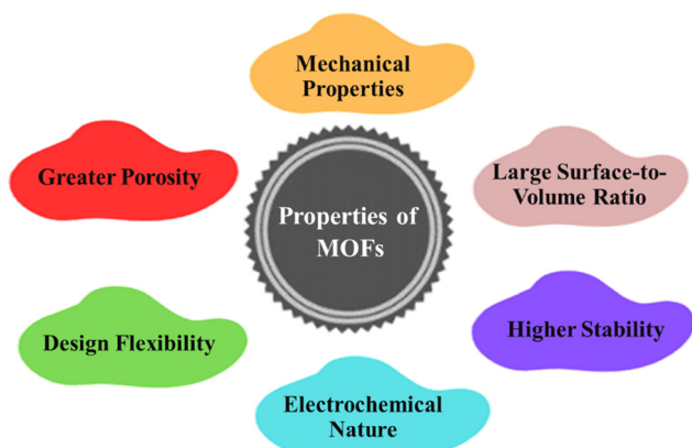
Fig. 1 Distinguishing properties of MOFs.

The capacity of MOFs to preserve their initial long-range organized structure in a certain chemical environment is referred to as stability. The reliability of frameworks is influenced by the strength of coordinate bonds, with increased bond strength leading to greater overall framework strength. 56 To achieve durability in metal–organic frameworks one approach is to create a synthesis method by pairing hard bases with high-valent metal ions, or soft bases with bivalent metallic ions. Additionally, the operational conditions, specifically pH levels, can significantly influence framework solidity. 57 External and internality stability of materials concerned with adsorption media surrounding it and the formation of metal ligand bonds respectively. 58 The various factors involved in the stability of the MOFs are presented in pictorial form in Fig. 4.