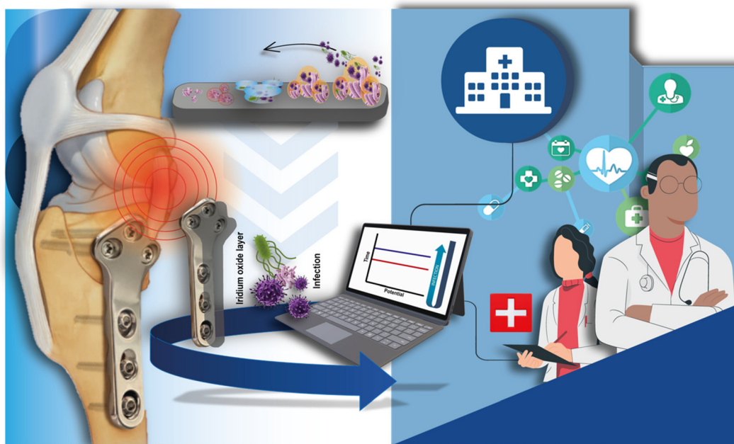
Fig. 1 Orthopaedic titanium-based implant modified with electrodeposited iridium oxide for pH monitoring in HI diagnosis.

related infections. 23,24 In this newly created environment, the bacteria produce acidic metabolites, such as lactic acid, acetic acid, formic acid, and carbonic acid, with a consequent local pH drop around the implant. 12,24,25 Thus, the detection of pH around the implant is a valuable target analyte for revealing implant-related infections.