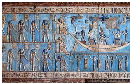
Fig. 1 Ancient painting in ceiling reliefs in the Hathor Temple in Gena, Egypt

It has superior stability and was produced by ancient chemists as a pigment (Fig. 1), which shows luminescent abilities even after