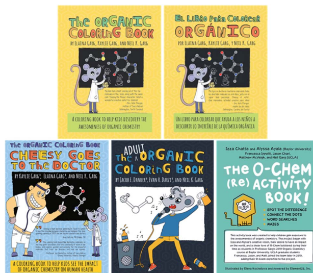
Fig. 5 The Organic Coloring Book series and The O-Chem (Re) Activity Book are designed to connect organic chemistry to the everyday lives of both children and adults.

The success of The Organic Coloring Book , as well as its medicine-themed sequel ( Cheesy Goes to the Doctor ), 23 led us to wonder whether we could develop similar resources to reach adults as well. Indeed, we felt that our motivations for creating the organic coloring book for children could also be extended to adults. As an example, “chemical-free” products are often marketed as desirable despite the impossibility of a product