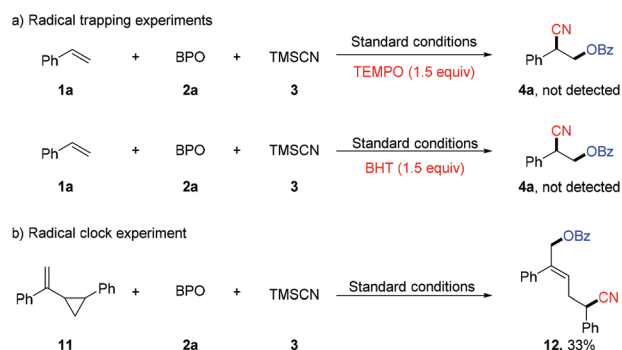
Scheme 3 Preliminary mechanistic studies.