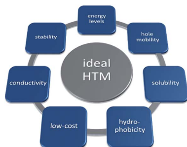
Fig. 2 Schematic representation of summarized HTM properties required for PSCs in an ideal case.

Among the inorganic hole conductors, only very few examples achieving high efficiency have been shown in the literature. Due to the limited choice of suitable materials, inorganic HTMs remain quite an unexplored alternative to the organic ones. The