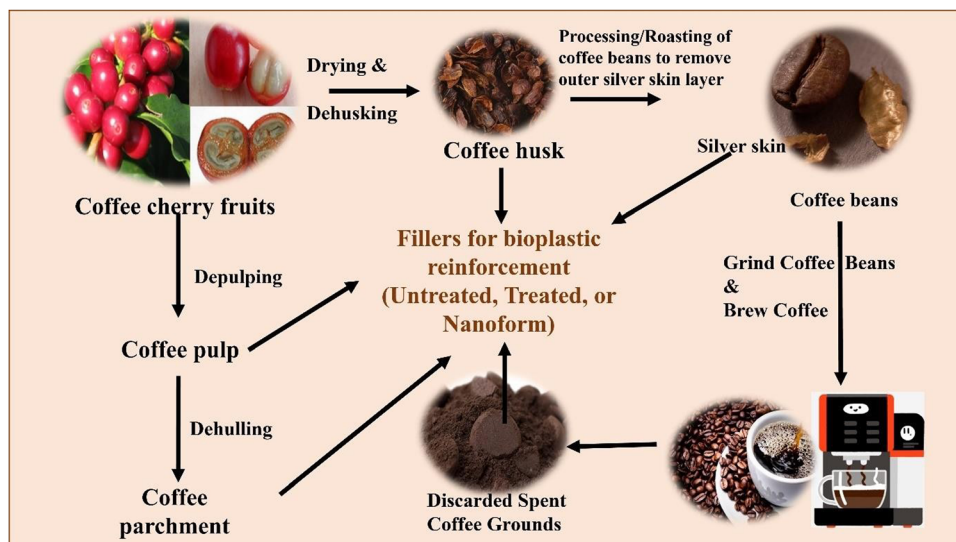
Fig. 8 Various coffee processing byproducts in the production of fillers [image created by the first author, Zeba Tabassum, utilizing data from ref. 55–58].

Fourier-transform infrared spectroscopy results confirmed the successful integration of coffee waste into the film matrix, as evidenced by the presence of an N–H bond. Incorporating coffee filler also improved the film's hydrophobicity, as indicated by an increased water contact angle compared to the neat film. The tensile properties of the biopolymer film were notably enhanced with the addition of 4 wt% coffee powder, achieving an optimum tensile strength of 35.47 MPa. The inclusion of coffee waste in the seaweed matrix resulted in improved functional properties of the fabricated biopolymer film. Therefore, the researchers concluded that the seaweed/coffee biopolymer film has the potential for use in food packaging and various other applications. 60