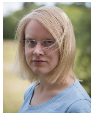
Hanna L. B. Boström

† Electronic supplementary information (ESI) available: The database of PBAs. See DOI: 10.1039/d2tc00848c