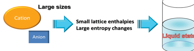
Fig. 1 Large ion sizes induce liquid state of ionic material.

Received 29th January 2022, Accepted 14th March 2022