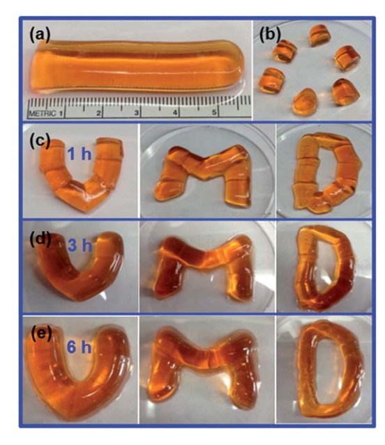
Fig. 2 The use of the self-healing nature of the hydrogel to produce complex architectures. (a) The original hydrogel. (b) The hydrogel after being cut. (c–e) The hydrogel segments arranged in the form of letters: U, M, and D, after (c) 1 hour, (d) 3 hours, and (e) 6 hours of self-healing.

The hydrogel networks consist of two types of interactions, that is, covalent bonds and ionic interactions. The self-healing of the hydrogel is driven by the dynamic ionic bonding between ferric ions and carboxylic groups of PAA. On one hand, the presence of a small amount of a chemical cross-linker ( \sim 5 mol%, MBAA/AA) led to the formation of the mechanically strengthened hydrogels with inter-chain chemical cross-linking