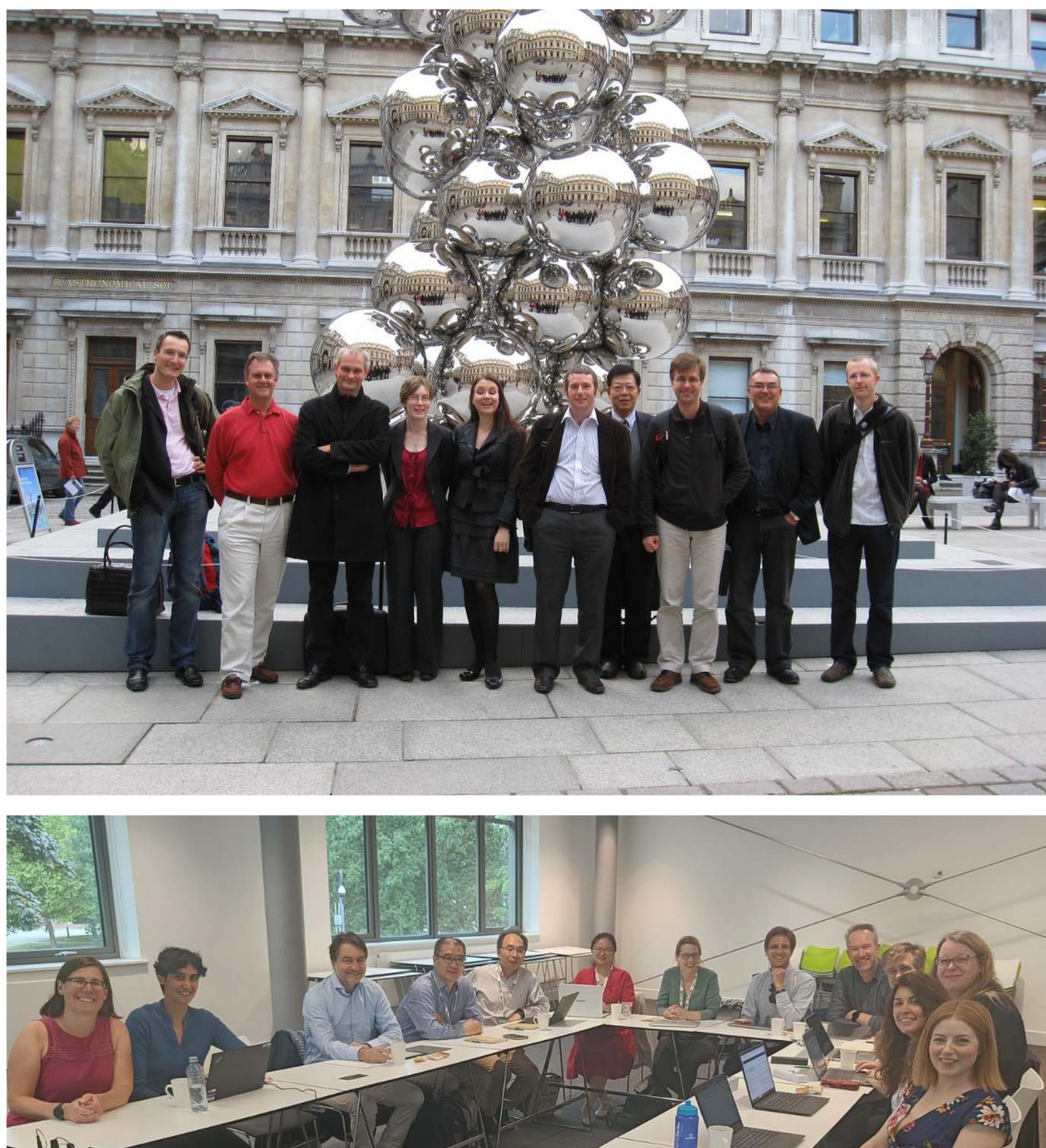
Fig. 1 2009 Polymer Chemistry Editorial Board meeting (top) and 2024 Polymer Chemistry Editorial Board meeting (bottom).

David and Christopher's footsteps and will aim to continue serving the broader polymer community building on the excellent foundations that have been established. As part of serving the community, I aim to work with other chemical societies in building on FAIR principles for the polymer community, as well as addressing global challenges such as sustainability. I look forward to leading Polymer Chemistry and, with our talented Editorial team, inspiring the future generation of scientists" (Fig. 1).