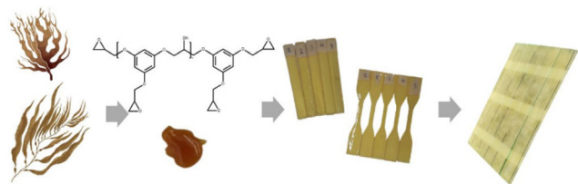
Scheme 1 Chemical formula of PHTE and the so-formed resin and glass fibre reinforced composite images.

Thermogravimetric analysis (TGA) measurements show high thermal stability for the cured resin system up to 320 °C, after which about 50% of the resin degrades within 40 °C, as can be observed in the TGA in Fig. S6a.† After 460 °C, secondary degradation takes place with almost no mass left at 800 °C,