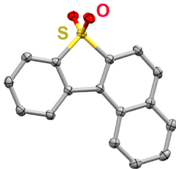
Fig. 2 Molecular structure of BNTD obtained from single-crystal X-ray diffraction studies. Yellow = S, red = O, gray = C; thermal ellipsoids at 50%; H atoms are omitted for clarity. CCDC 2350924.†

in activity should be due primarily to electronic and not steric effects.